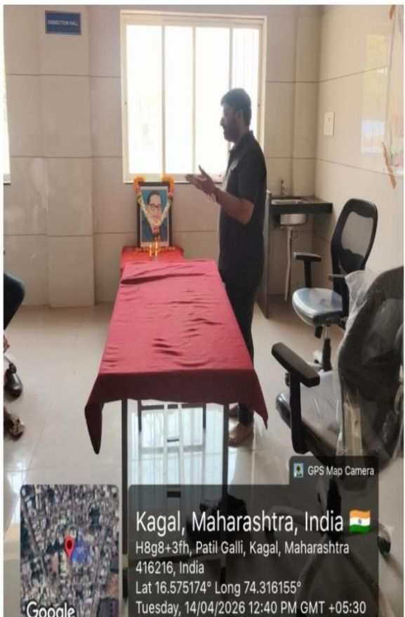
Kagal, Maharashtra, India H8g8+3fh, Patil Galli, Kagal, Maharashtra 416216, India Lat 16.575174° Long 74.316155° Tuesday, 14/04/2026 12:40 PM GMT +05:30