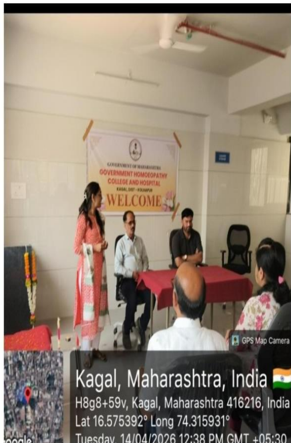
Kagal, Maharashtra, India H8g8+59v, Kagal, Maharashtra 416216, India Lat 16.575392° Long 74.315931° Tuesday, 14/04/2026 12:38 PM GMT +05:30