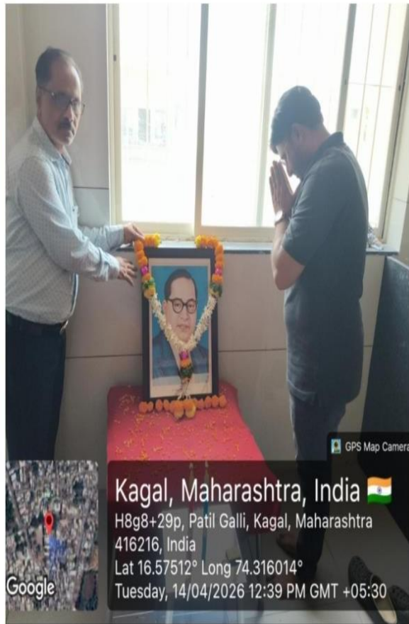
Kagal, Maharashtra, India H8g8+29p, Patil Galli, Kagal, Maharashtra 416216, India Lat 16.57512° Long 74.316014° Tuesday, 14/04/2026 12:39 PM GMT +05:30