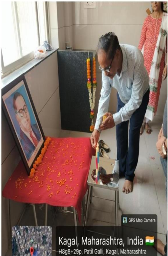
Kagal, Maharashtra, India H8g8+29p, Patil Galli, Kagal, Maharashtra